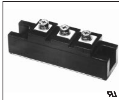
CD410830 Dual Diode POW-R-BLOK™ Modules 30 Amperes/800 Volts