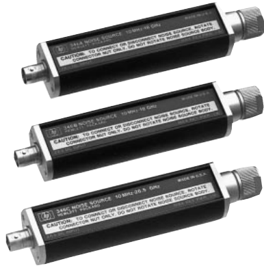
HP 346A, 346B, 346C